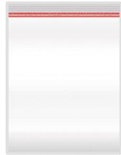
Clear Bags Smaller than 12" x 6" x 12"