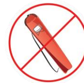
Folding Chair Bag (Folding chairs not Permitted)