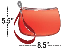
Bags Smaller than 5.5" x 8.5"