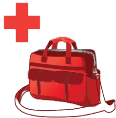
Medically Necessary and Diaper Bags