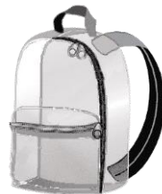
Clear Back Packs