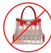
Printed Pattern Plastic Bags