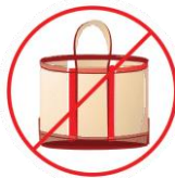
Oversized Tote Bag