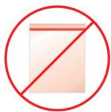
Tinted Plastic Bags